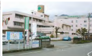
Izu Health and Medical Center

Izunokuni is home to numerous medical facilities, including the Juntendo University Shizuoka Hospital, which is designated by Shizuoka Prefecture as a disaster base medical center. Numbering around 100,000, the city is home to the prefecture's largest population of doctors and pharmacists. It also ranks among the top for number of hospital beds and number of hospital facilities, making it home to the prefecture's premier medical system.