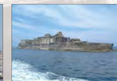
Hashima Coal Mine