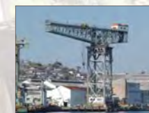
Giant Cantilever Crane

The second phase from the 1860s accelerated by the new Meiji Era, involved the importation of Western technology and the expertise to operate it; while the third and final phase in the late Meiji period (between 1890 to 1910), was full-blown local industrialization achieved with newly-acquired Japanese expertise and through the active adaptation of Western technology to best suit Japanese needs and social traditions, on Japan's own terms. Western technology was adapted to local needs and local materials and organised by local engineers and supervisors.