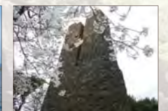
Hagi Reverberatory Furnace