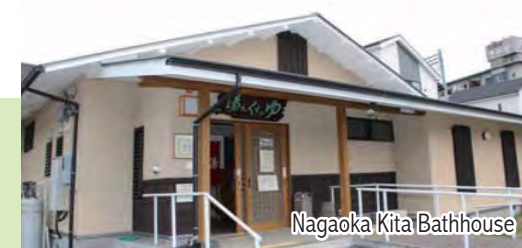
Nagaoka Kita Bathhouse