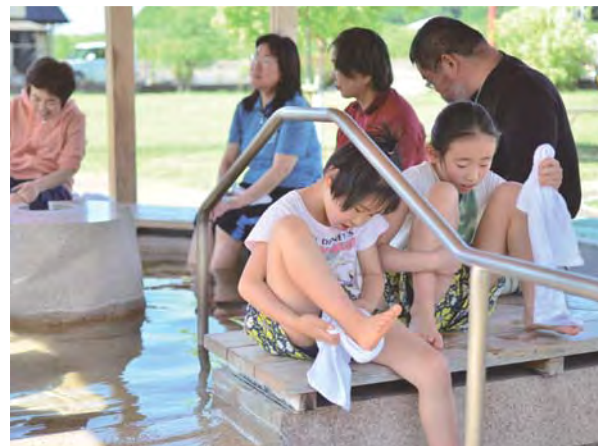
Yoritomo Foot Bath

Hot springs are bubbling up from underground all across the Izu peninsula. Even within Izunokuni City, one can find a number of hot springs, including the Nirayama, Ohito, and Hatake hot springs, each unique in its own way. Particularly prestigious among these is the Izu Nagaoka hot springs, which consists of the Kona hot spring, one of Izu's three oldest hot springs with over 1300 years of history, and the Nagaoka hot spring, which opened during the Meiji period. With over 30 Japanese hot spring inns and hotels located within the city, Izunokuni is a steamy hot springs resort: perfect for letting go, relaxing, and enjoying yourself. Come experience Izunokuni's "healing waters," a fusion of rich, elegant culture and the hot springs that are Earth's gift to us.